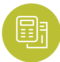
Accounting and Finance