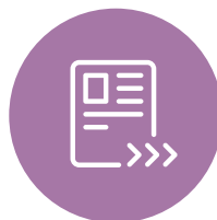
Business communication (written)