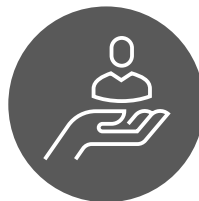
Risk and insurance (including insurance coverages and company operations)