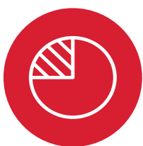
Economics (micro and macro)

It is important that a university education also provide supporting coursework that will meet the SOA's VEE requirement. This requirement asks actuarial candidates to demonstrate that they have had sufficient coursework in three areas not tested on the actuarial exams: